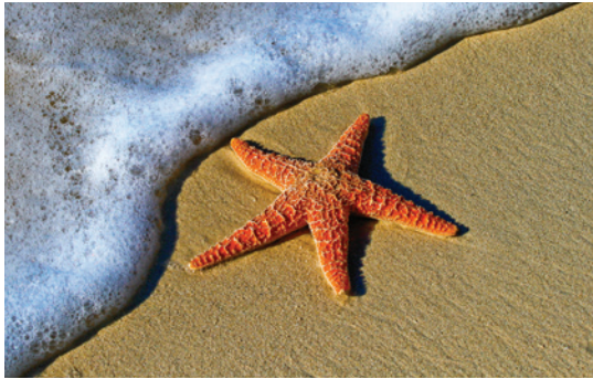
Little Science and Dinosaur Walk. Museums Victorian Online

https://museumsvictoria.com.au/learning/online-resources-and-tools/