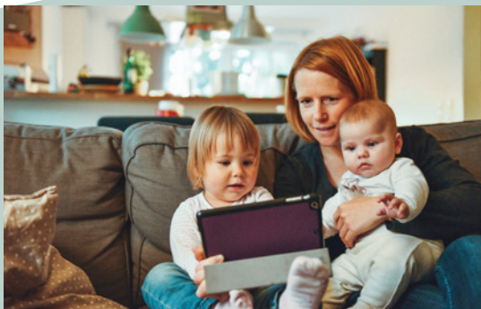
ABC KIDS PLAY

https://www.youtube.com/user/CosmicKidsYoga