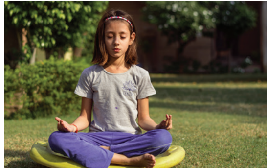
Yoga and Relaxation/Storytelling, Movement and Gross Motor Skills

https://museumsvictoria.com.au/learning/online-resources-and-tools/