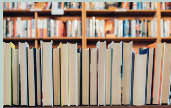
Port Phillip e-library

https://www.abc.net.au/abckids/abc-kids-play-app/11131080