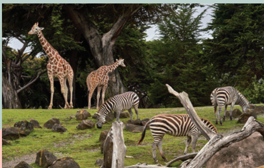
Zoos Victoria Online Streaming

https://library.portphillip.vic.gov.au/eLibrary